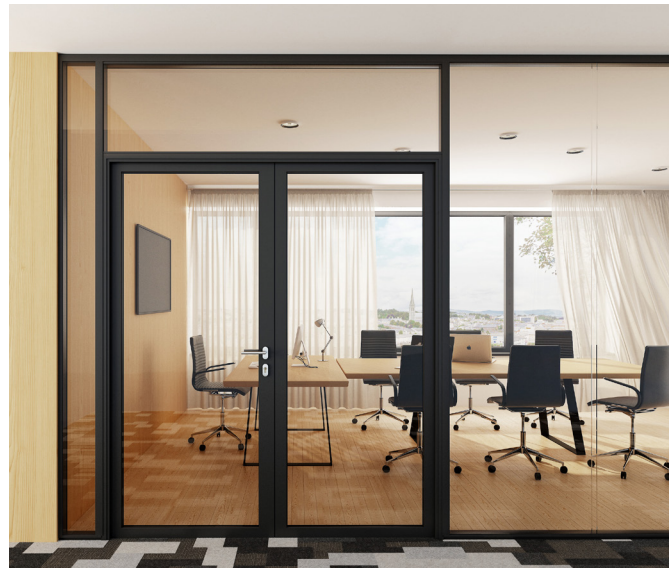
Aluminium-framed glass double-leaf door with overlight